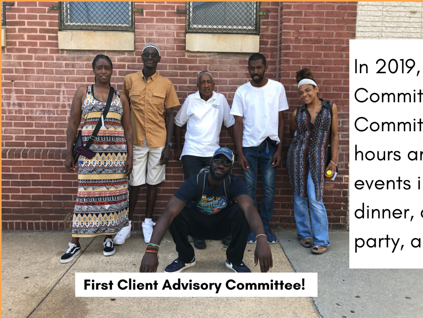
First Client Advisory Committee!

In 2019, we launched our first Client Advisory Committee. Over the year, Client Advisory Committee members logged over 1,000 hours and implemented several community events including a community feedback dinner, our first annual harm reduction block party, and regular participant outings.