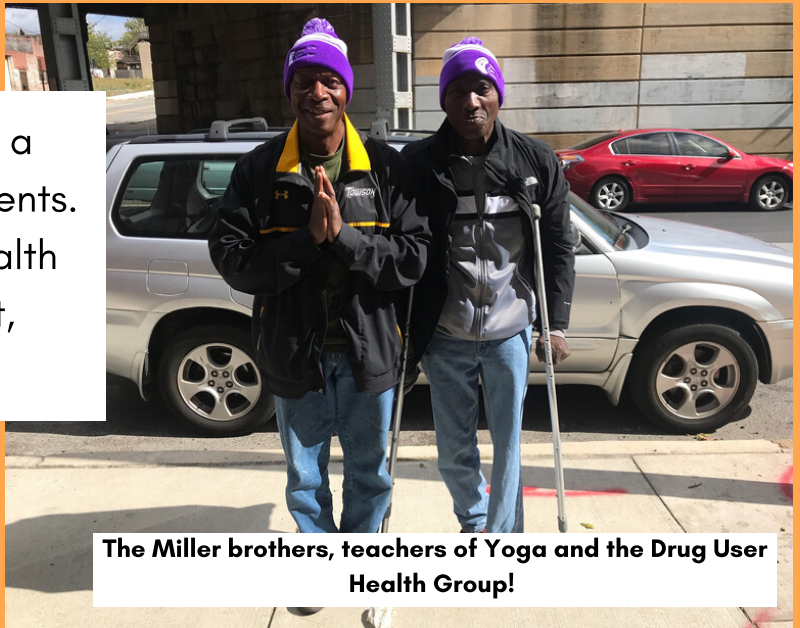
The Miller brothers, teachers of Yoga and the Drug User Health Group!

During our drop-in hours, we offered a number of engaging activities for clients. These included yoga, a drug user health group, movie screenings, ladies night, and creative art projects.