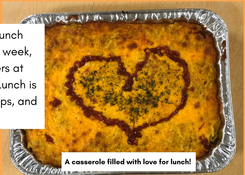
A casserole filled with love for lunch!

This year we started a community lunch program, serving hot lunch twice a week, which we received from our partners at Amazing Grace Lutheran Church. Lunch is a time to connect, build relationships, and grow community.