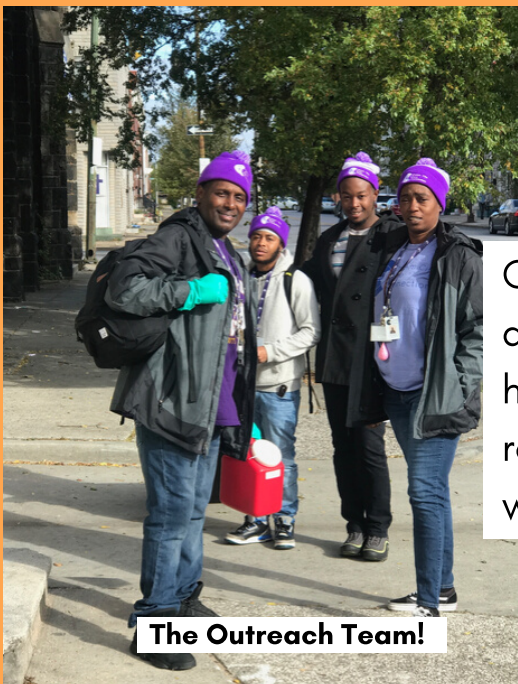
The Outreach Team!

Our outreach team connected with people in alleys, abandoned houses, and parks. We linked people to harm reduction services, drug treatment, and food resources. Literally and figuratively, we meet people where they are.