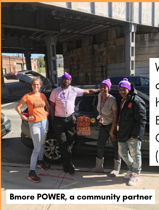
Bmore POWER, a community partner

We built connections and grew relationships with our community partners in Baltimore. We are grateful to have worked with BRIDGES coalition, Bmore POWER, Baltimore Harm Reduction Coalition, SPARC, Amazing Grace Lutheran Church, and Baltimore Save Haven (to name a few)!